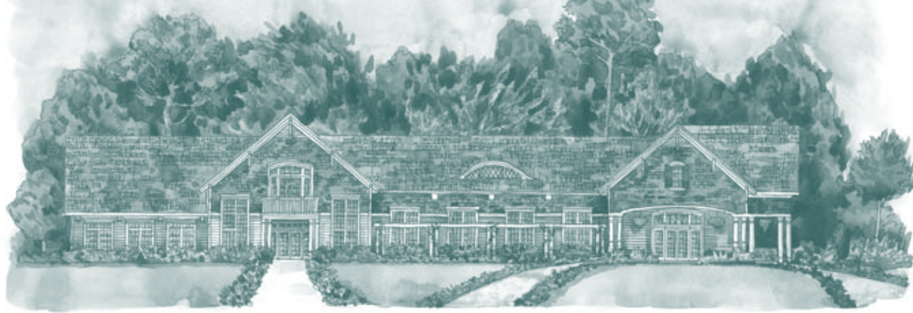
Carolina Colours Pavilion

thought and expertise went into the planning of this uniquely designed facility. Abundant porches and a variety of indoor and outdoor activity areas will make it a fun and functional gathering place for our community owners and guests.